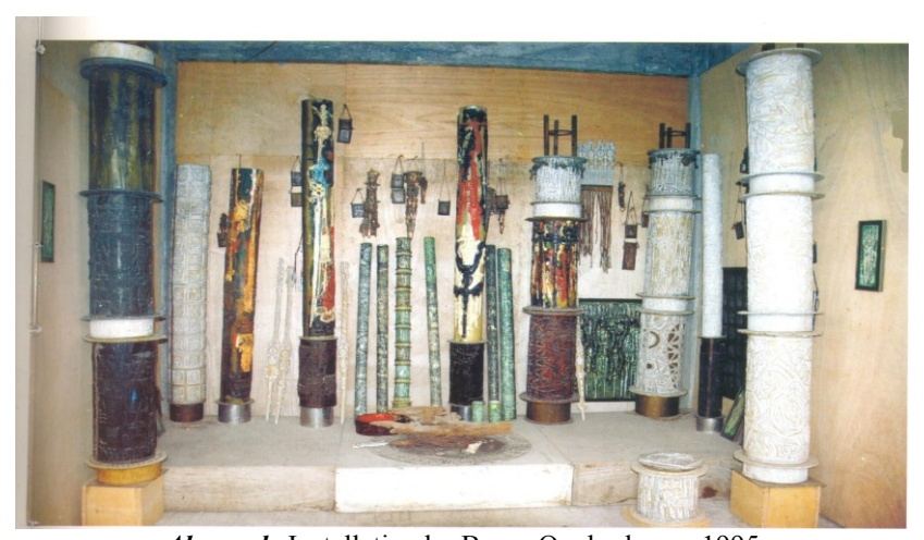
Akporode Installation by Bruce Onobrakpeya 1995

The art pieces created through experiments over a period of two decades have themes based on the worldviews of our people and their cultural values, wisdom, belief, mythology and cosmology. The varied items repeated in different techniques and materials, is an attempt to discover the best visual representation of the ideals, local and foreign, which is as an attempt to create synthesis. (Onobrakpeya.1995:234)