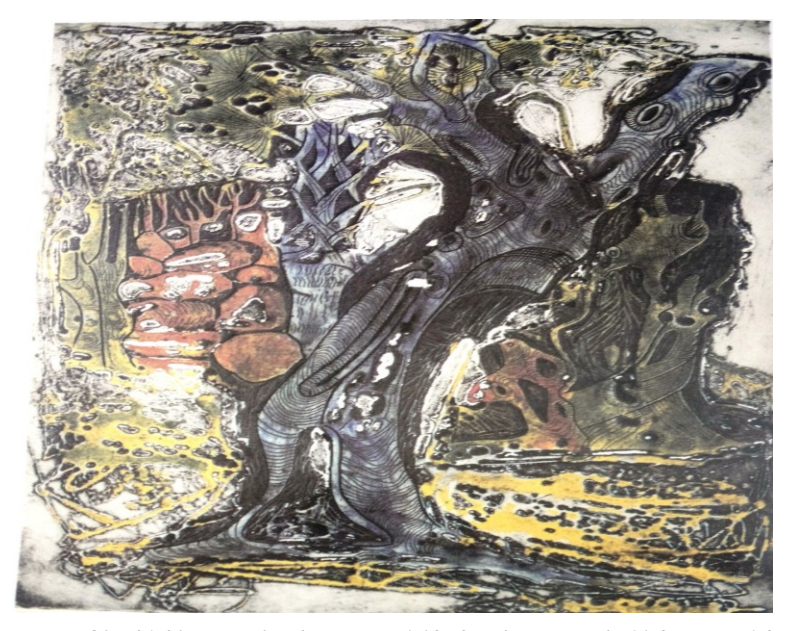
Urhe ovo No Ro Ojo (A big Tree in the Forest) 1973 Plastograph 61.2cm x 46.3cm

This Lyric inspired the artist to produce his own rendition in print titled Urhe ovo No Ro Ojo (see print below:) meaning the first tree in creation. The print shows a very big tree with lots of branches with various animals perching on them. Among the animals is the Chameleon ( Eghwughwe ), believed to be the oldest of living creatures, which explains the reason why he treads the soil softly because it witnessed the formation of the earth. The Yoruba still holds such belief about the Chameleon (Idowu. 1962:25).