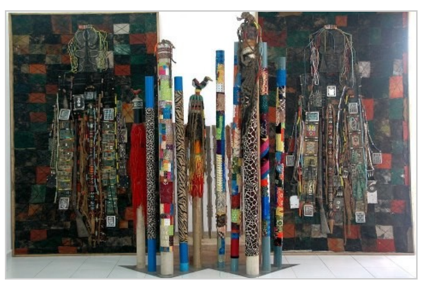
Aro Eghwere: Installation by Bruce Onobrakpeya 2012

African cultures. The monolithic nature of the rolled-up column is in itself a comment on the tubular bronze staffs of Urhobo shrines, the bronze ivory mounts of Benin court art and the thousand year old cylindrical bronze anklets unearthed at Igbo-Uku in the heart of Igboland.