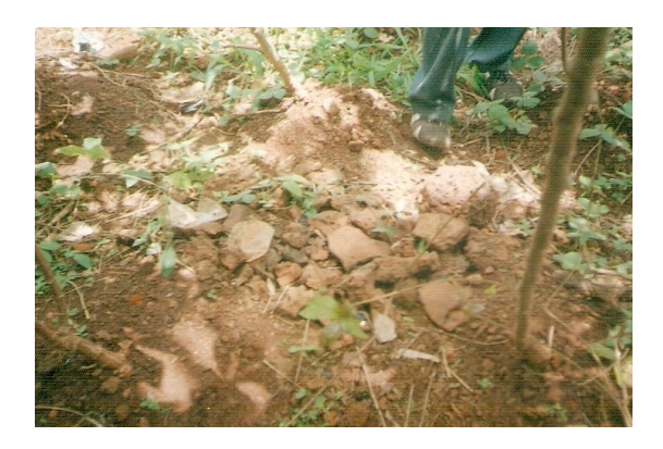
Plate 10: Abandoned Iron Smelting Site

As can be seen from the above discourse, Ezeagu, Awhum, Opi and Umundu host a variable number of resources which can be harnessed for tourism. The cultural and economic values of these resources are high as the residents derive and depend greatly on them for survival. The Ogba deity in Ezeagu cave is believed to be the protective agent of the land among other significant functions. The springs constitute a major source of drinking water for the communities, while the waterfalls, which are also a source of drinking water to the host villages, attract visitors from far and near thereby generating economic gains. In Awhum, the waterfall generates income for the community as visitors troop in for sight seeing, while the monastery is valued