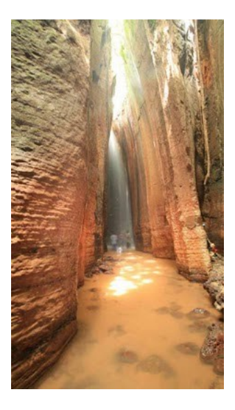
Plate 3: Awhum Waterfall

Awhum waterfall is surrounded by a breathtaking landscape. The evergreen vegetation is a unique scenic attraction of its own. The fact that the students of University of Nigeria, Nsukka and Enugu Campuses (UNN/UNEC), Enugu State University of Science and Technology (ESUT) and Institute of Management and Technology (IMT) always host their picnics there attests to the attractiveness of Awhum waterfall and its environs. Three kilometers before the waterfall is Awhum cave ( Ogba ) with an entrance of 3.2m high and 2.2m wide. The cave harbours varieties of biological species like wild animals and birds of different species. The monastery on the other hand is sacred because of its religious implications. It houses a number of pilgrims from different parts of the crucifix.