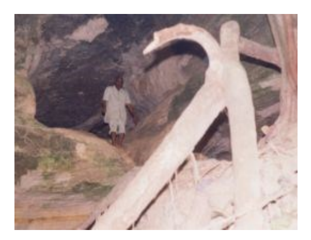
Plate 4: Awhum Cave