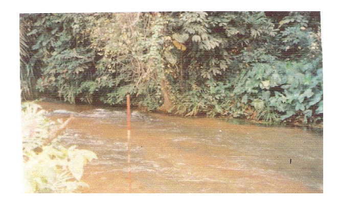
Plate 1: Agada Spring