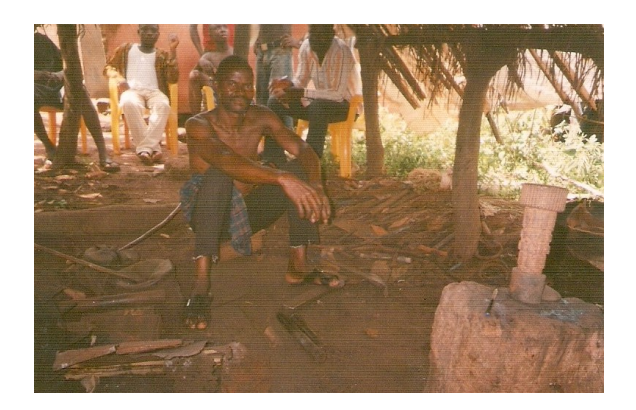
Plate 9: Black Smith Site