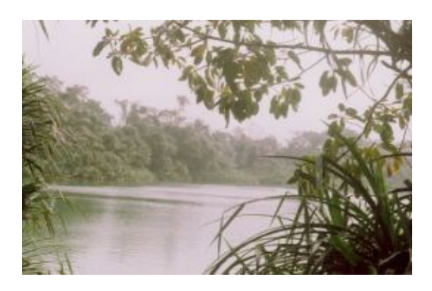
Plate 2: Ihuneke Lake